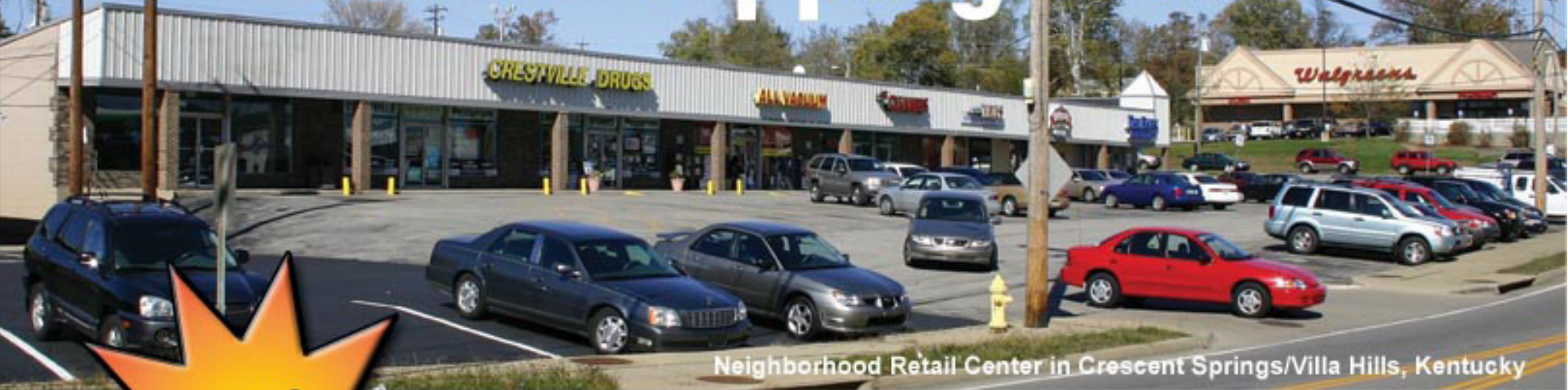
Neighborhood Retail Center in Crescent Springs/Villa Hills, Kentucky