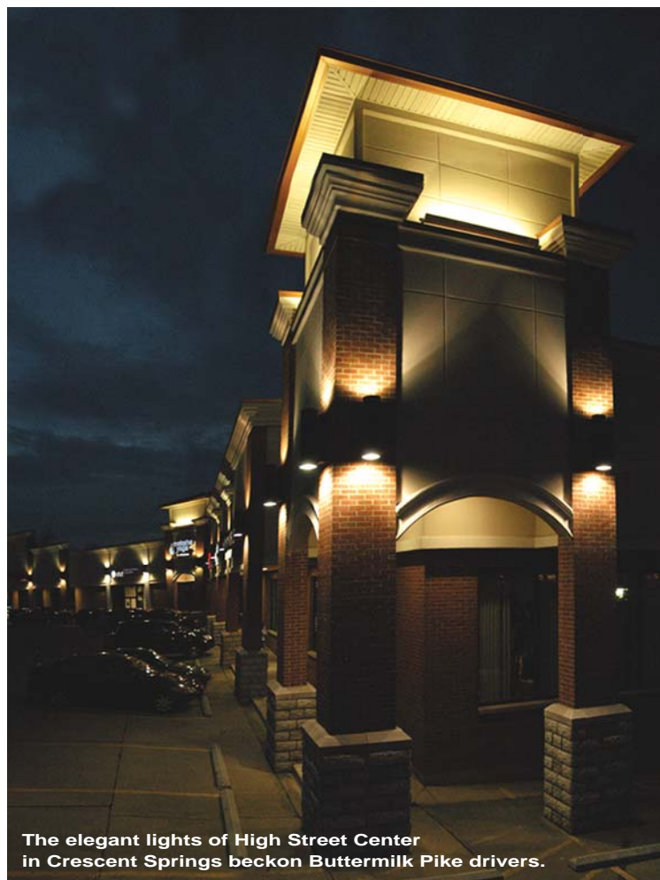
The elegant lights of High Street Center in Crescent Springs beckon Buttermilk Pike drivers.

Unique items include bamboo floors, earth friendly cork, and the use of many recycled materials. One studio was designed to be continuously heated to 98°F for the hot yoga (Moksha) effect that safely detoxes the body.