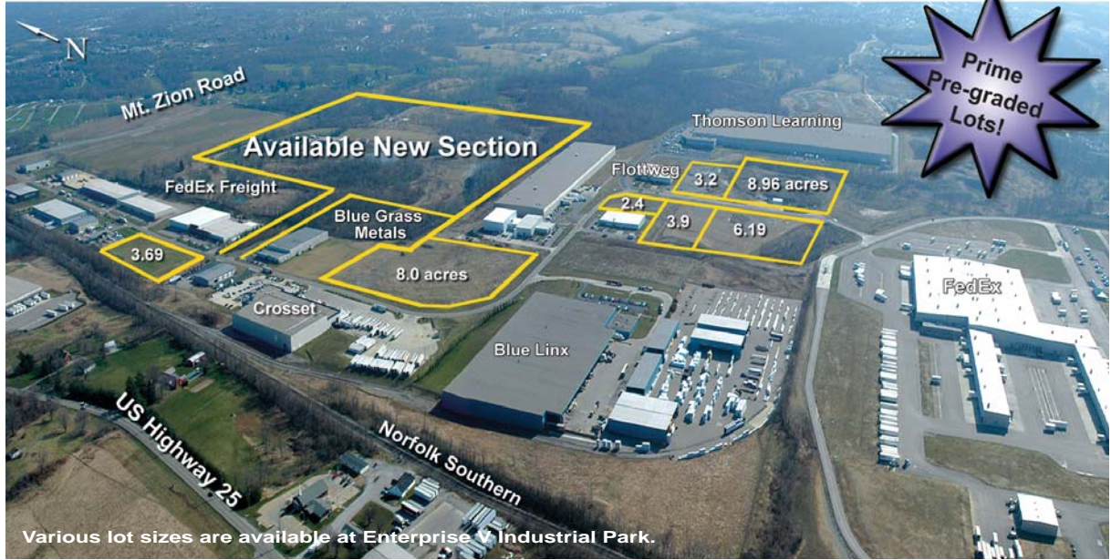
Various lot sizes are available at Enterprise V Industrial Park.

Businesses who recently have taken advantage of available acreage