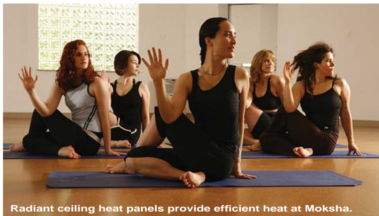
Radiant ceiling heat panels provide efficient heat at Moksha.