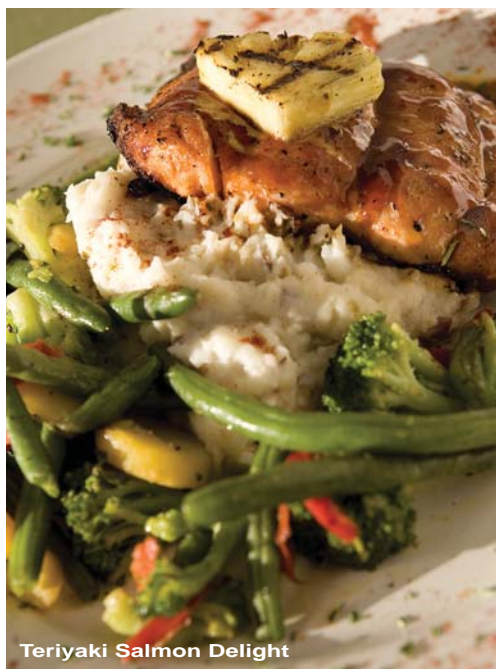
Teriyaki Salmon Delight

Toebben Companies' North Bend Square at 1960 North Bend Road in Hebron has a new restaurant. The Island Palm Bistro & Bar hit the ground running in December and hasn't slowed down since. Business has been brisk for the island-inspired bistro. Their casual motif, generous happy hour, and live music is already creating repeat customers.