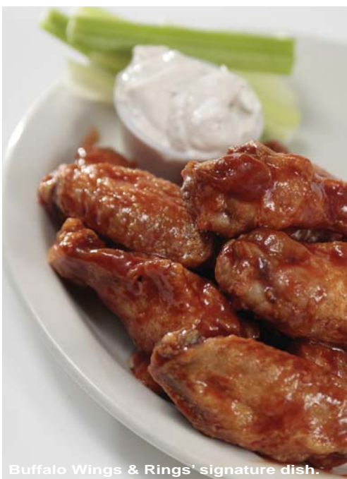
Buffalo Wings & Rings' signature dish.