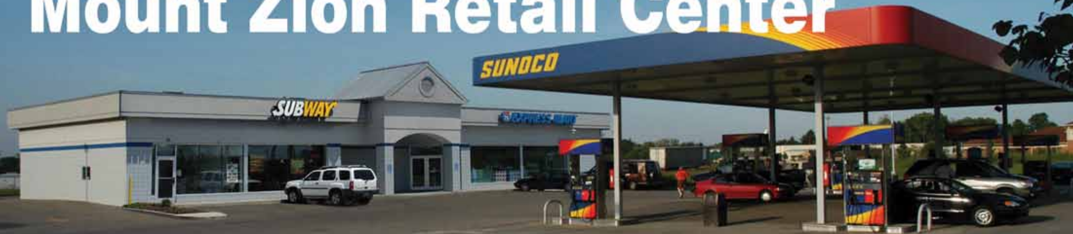
Neighborhood Retail Center, Florence, Kentucky