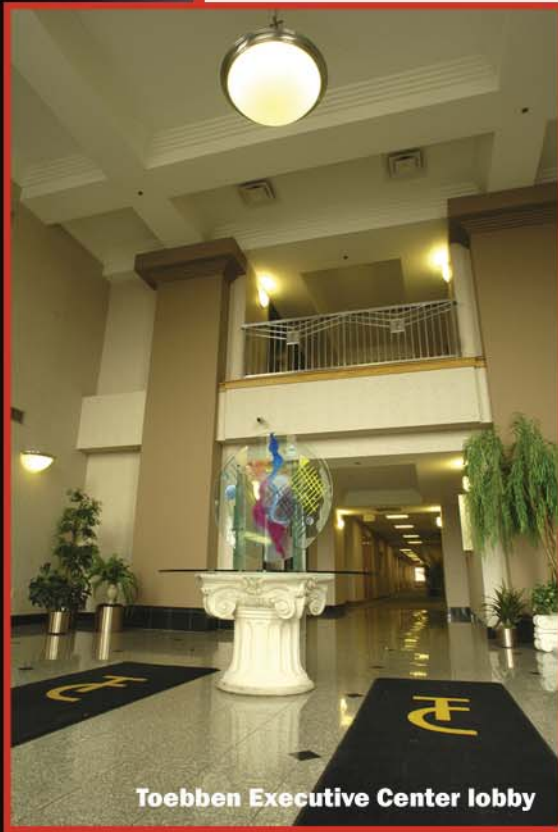
Toebben Executive Center lobby